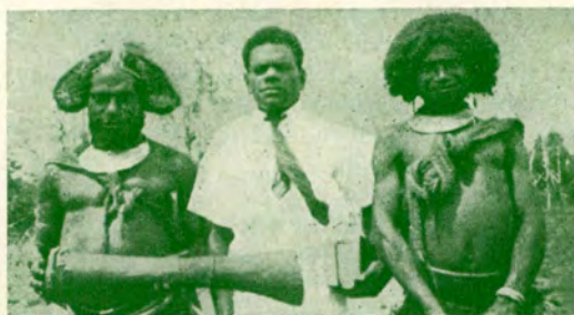
Men of Tari and their Teacher.