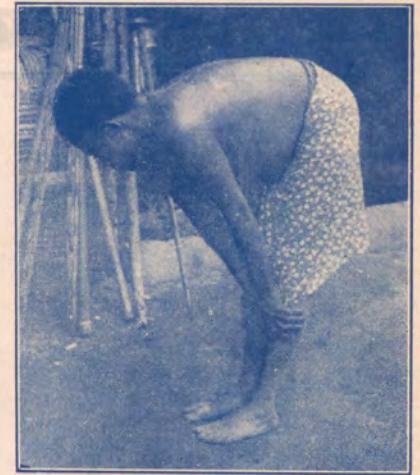
Woman bowing in the presence of a male relative