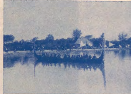
Canoe at Roviana