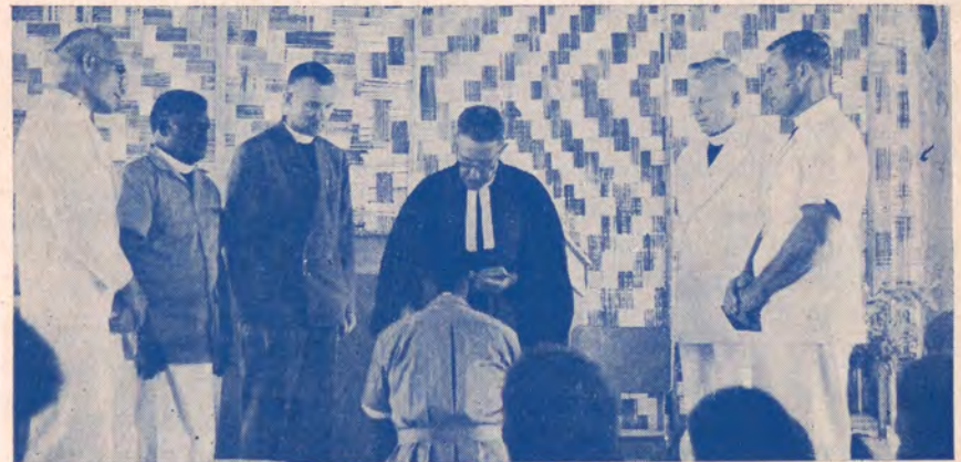
The Growing Church — Ordination.