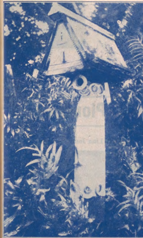
Skull house at Roviana