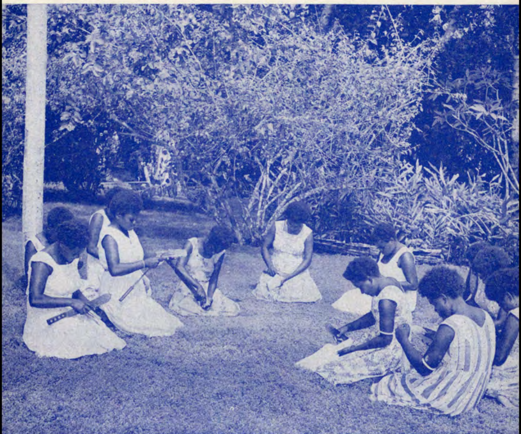
KIHILI SCHOOLGIRLS MAKING FANS.

Missionary Organ of the Methodist Church of New Zealand