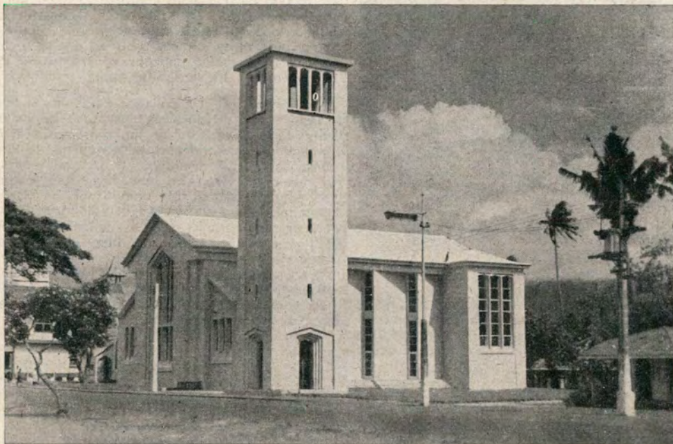
WESLEY CHURCH, APIA.

Third, because we are members of the one Body. The New Testament demands that those who are 'in Christ' should be spoken of as being in His Body, the church, and should manifest a common life of faith and service, of sacraments and ministry. The tragedy, to-day, is that in this respect, there is a contradiction between our profession and our life as churches. The God-given unity of the church is to a large extent hidden by our divisions.