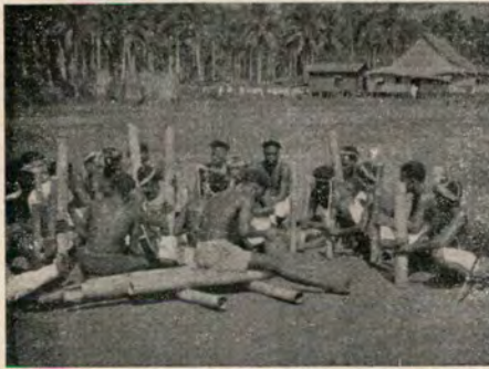
Banga Students' Bamboo Band.

They were very late to complete this building because the materials which they needed for the building were very late on the steamer. So they had to wait for some months more. After four or three months the steamer came from Sydney to Gizo and brought some aluminium for the roof and many other things which they needed for the building. So now they had to finish it on the 25th of February, 1957. This is the first building which carpenters had to build here at Banga, where we want to lay up the foundation for the future generation of the Solomons.