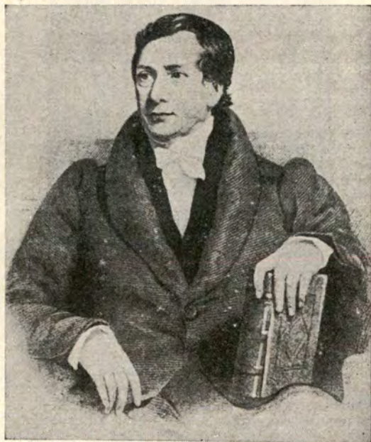
Rev. John Williams, pioneer missionary of the London Missionary Society, killed in the New Hebrides 1839.

However, when these Islanders return to their home villages, as many do, they present a problem. Having become accustomed to the high scale of wages in this country, they have developed new material needs. But it is in mind and heart that the greatest conflict arises—the old Island community pattern of life versus the freer, individualistic type they have known here. Younger leaders, with a knowledge of both worlds, are needed to help them resolve their difficulties in a time of adjustment. So the Samoan Church and the Cook Islands Church are sending some of their promising theological students to the N.Z. Congregational College in Auckland. This new venture is full of possibilities, also, for raising the standard in Island colleges, and ultimately in Island churches.