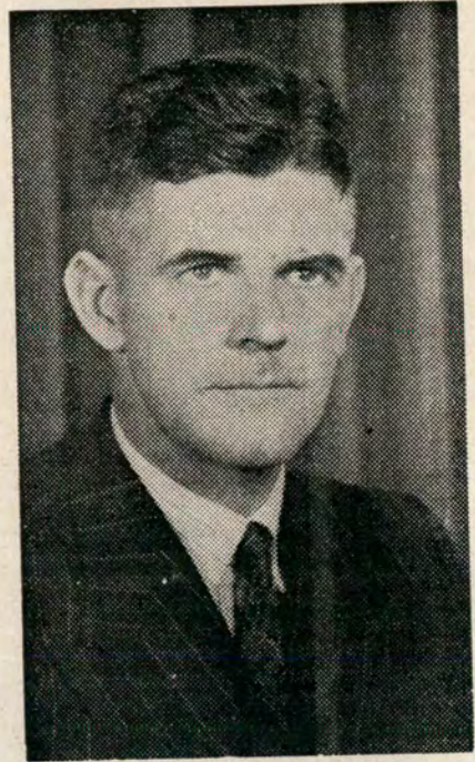
HON. R. GARFIELD TODD, Former missionary. Now Prime Minister of Southern Rhodesia.

possible to embark on a large-scale building programme, which will assist in meeting the accommodation needs of an ever-expanding work.