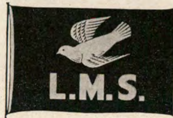
House Flag of the London Missionary Society.

Some New Zealand Congregationalists hold that our primary duty is to unite with the Christian churches of the Islands, rather than, or shall we say, before, seeking union with other denominations within N.Z.