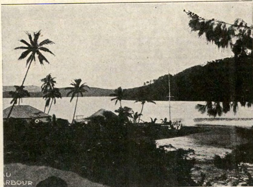
A Typical Islands Scene.

The only difficulty connected with this splendid organisation is found in the fact that its success has made some men think "Missions" are only for women! That, however, is offset by the amount of support for the work that the members extract from the men! Altogether the P.W.M.U. has been a source of great blessing and strength to the Missionary Cause in our Church.