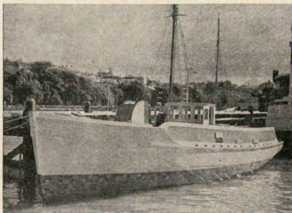
"Fauabu Twomey" at her launching.

the regular grants received annually for the leprosy and general medical programme of the missions concerned. These general grants have totalled £29,750 to the Methodist Mission alone since the grants commenced in 1942. Without them our medical and leprosy relief programme in the Solomon Islands must have been greatly restricted. The grants have enabled expansion of the work, despite the startling rise in the cost of drugs and medical services generally.