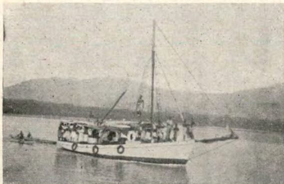
The "Daphne" which was of valuable service in re-establishing the work in Buka and Bougainville after the war.

There is a difference about Methodism in Bougainville. In so many of the scattered Pacific Islands groups, Methodism is dominant. Our workers have often been almost the only ones in the field. It does us good to remember that God blessed the efforts of our pioneers, and we have to-day some hundreds of thousands of Pacific Islanders who look to the Methodists of Australia and New Zealand for spiritual leadership and support: For the success of past years has been bequeathed to us as a heritage. In co-operation with the emerging young Churches in these groups, we still have a missionary task. In the circuits of Roviana, Vella Lavella and Choiseul, in the Solomons, the same is true.