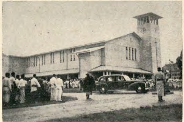
Methodism serves the Pacific: The new Church at Nukualofa, Tonga.

At the final session of the Conference observers from the missionary, international and scientific organisations addressed the Conference on their particular work and congratulated the Commission on its work and growth.