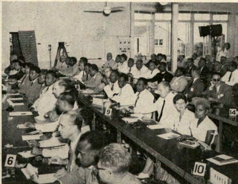
The South Pacific Conference.

A number of observers representing a wide field of Governments, Institutions and missionary groups interested in the welfare and future of the peoples of the Pacific, were invited by the Commission to attend the Conference. The governments of all the constituent powers sent observers and messages were read from Mr. John Foster Dulles (U.S.A.), Mr. R. G. Casey (Australia), Mr. Henri Luns (Holland) and from France and the United Kingdom. The Christian Missions were represented through observers from the National Missionary Councils of Australia and New Zealand, the Roman Catholic Missions and the Netherlands Reformed Church. Other observers were present from UNESCO, WHO, FAO (Rome), the Australian Research Council, Australian National University and from various scientific groups in France, the U.S.A., Britain and Holland.