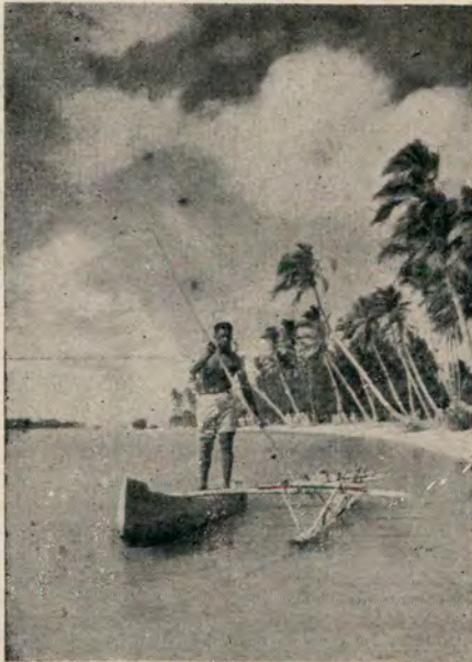
A typical Islands scene.

Throughout the discussion there was evidence of the conflict, never resolved and perhaps never possible of final solution between the old and new; the strong pull of age-old custom against the allurements of modern western ways of life. To-day there is in the Islands a strong desire for European food and clothing; for education and travel. The economic problem facing every Pacific community is: "How can we keep our old leisurely ways and at the same time earn more money to buy the things we want? How can we lie in the shade from the heat and talk and sleep and yet buy things from the shop? Inherent in almost every session was this enigma—nostalgia for the old—hunger for the new. Some of the younger representatives were ready to jettison many old customs. A woman from New Guinea resented the marriage custom of the bride price which kept women in an inferior place. A medical officer from the Cook Islands deplored the custom of bringing the sick home when death was imminent. A young man complained that in his area young men worked hard to gather the wherewithal for marriage, but on the marriage night everything, even the clothes, were divided between friends and relatives. Some older representatives, however, looked wistfully back. "In my village," said one, "custom is dead. Some have thrown custom away to be Christian. Some have thrown it away to be nothing at all."