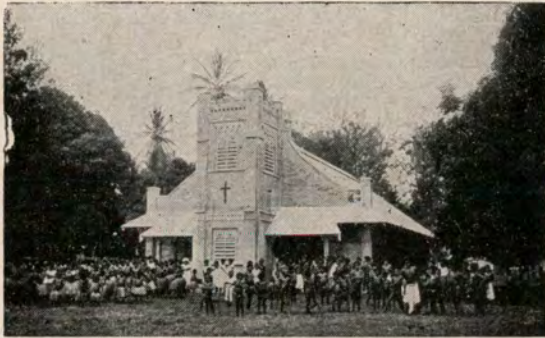
Bromilow Memorial Church, Dohu, Papua.

deliberations at this Conference, and in the resolutions which may arise from it, you may often find yourselves rightly calling on the Commission to take action which would result in further work for your territorial administrations. At the same time, however, I hope that you will pay particular regard to the immense resources of manpower, local materials and inherited or acquired skills that lie in the hands of your own communities; and to the creation and development of self-help organisations, based on traditional forms but geared to modern needs, which can utilise these resources for the benefit of the community as a whole."