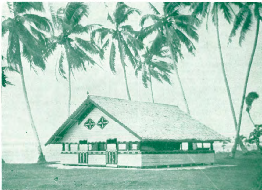
MISSION SCHOOL, BUKA, BOUGAINVILLE.

The Missionary Organ of the Methodist Church of New Zealand