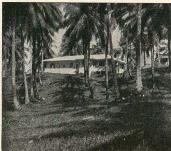
Mission House at Buka.