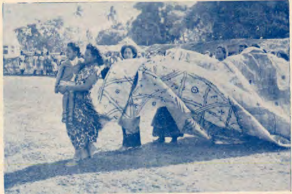
Ceremonial presentation of tapa cloth.

The presentation of gifts was, in turn, followed each day by a remarkable display of native dances. These dances and their accompanying songs were practically all descriptive of the building of the new church and of the arrival and development of Christianity in Tonga.