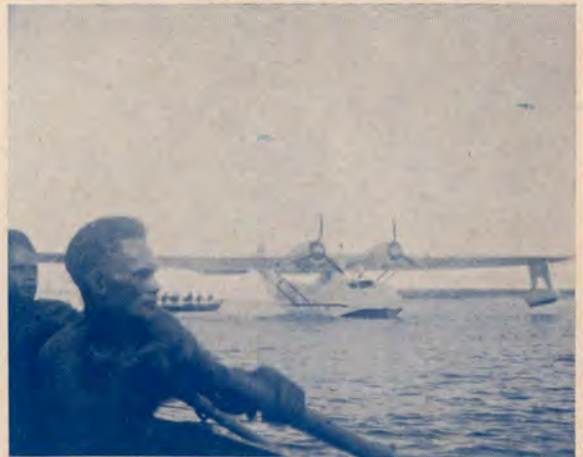
The arrival of the Catalina at Skotolan, May, 1952, bringing the New Zealand representatives to the Jubilee.

Service starts promptly at 8 a.m. and lasts for nearly two hours. Some people may say that it is too long. However, here when we consider that only once in a year do the people come in with their choirs and to hear the Christmas messages, even two hours is not long. My first Christmas and Thanksgiving Service at Skotolan lasted four hours. Well, we had short greetings, prayers and a very short address. Into it all we have to fit 15 village and station choirs. This year their numbers are all very well chosen and the whole