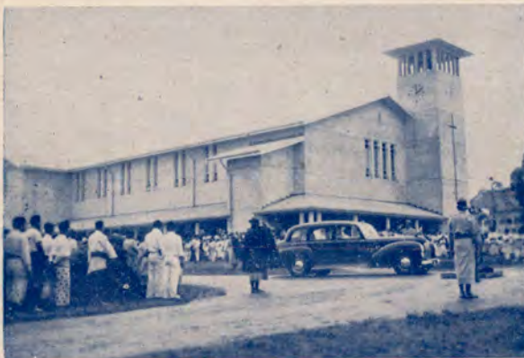
The New Jubilee Church, Nuku'alofa, Tonga, showing the arrival of Her Majesty Queen Salote to open the building.

This stone was laid to the Glory of God by her Majesty Queen Salote Tupou on the 2nd day of July, 1926."