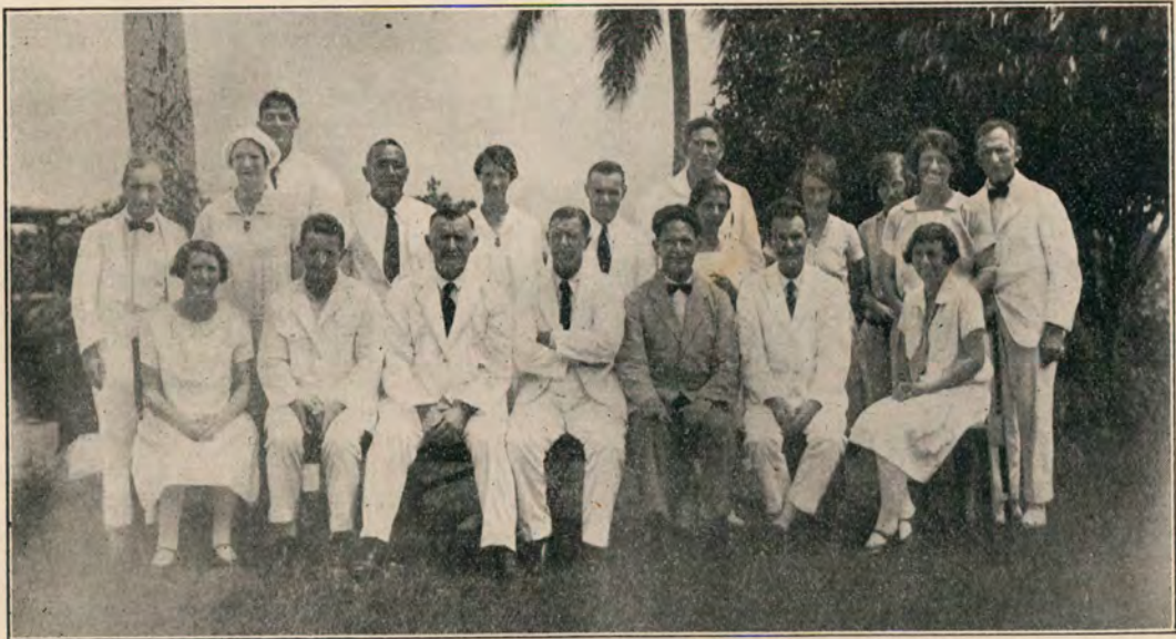
SOLOMON ISLANDS MISSION SYNOD, 1928,