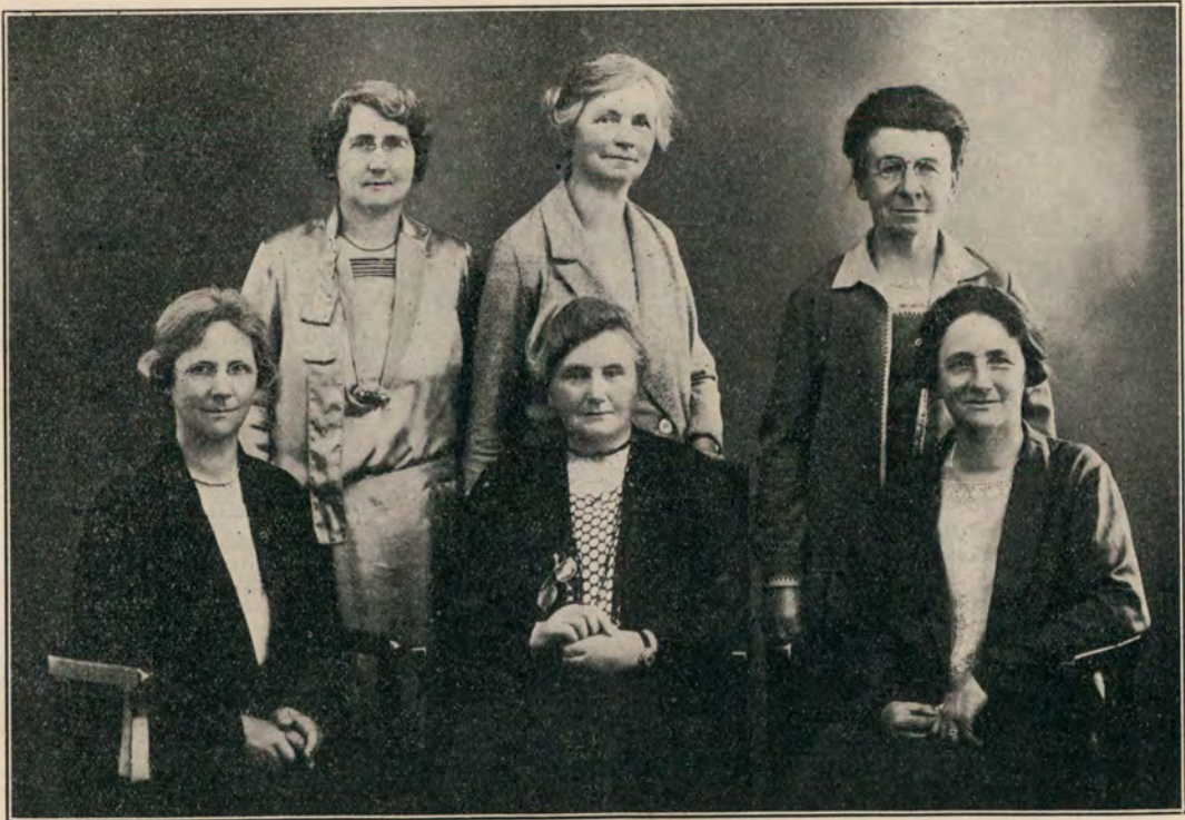
THE EXECUTIVE OF THE NEW ZEALAND METHODIST WOMEN'S MISSIONARY UNION.