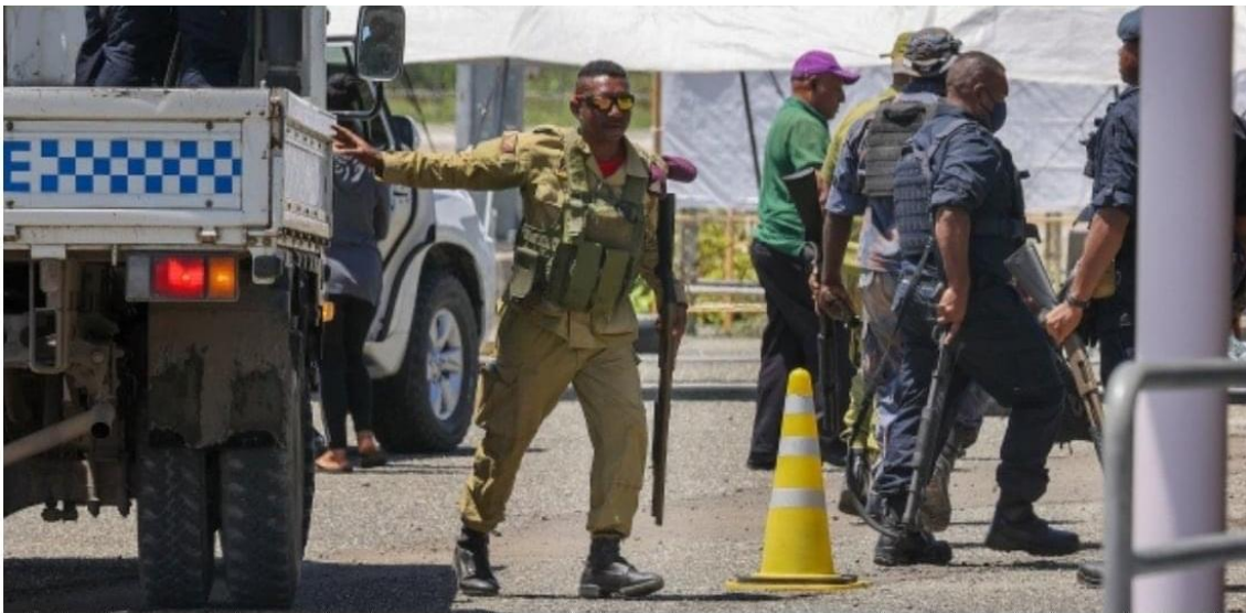
Under the gun ... Solomon Islands security forces deploy to Honiara's streets after violence broke out last week