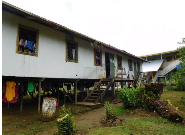
Girls' Dormitories without the toilet facilities

Tabaka Rural Training Centre was started by a group of volunteers from the Methodist Church of New Zealand in 1992. It was established to train youth in a skill which would enable them to earn a living. Over the past 27 years this centre has grown into a technical institute with over 250 students, boys and girls receiving technical training in eight different areas.