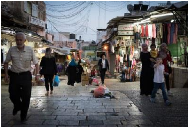
Life in the Old City, Jerusalem.

World Council of Churches (WCC) general secretary Rev. Dr Olav Fykse Tveit on 29 January urged the international community not to support a proposal by US president Trump and Israeli prime minister Netanyahu for dividing up Palestine and Israel - a plan developed with no meaningful participation from the Palestinian people.