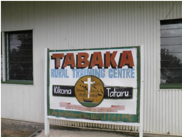
The Centre in operation since 1992