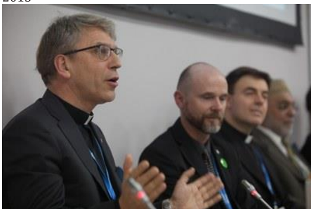
WCC general secretary Rev. Dr Olav Fykse Tveit at the UN climate talks.

COP21: “A moment of truth” - 01 December 2015