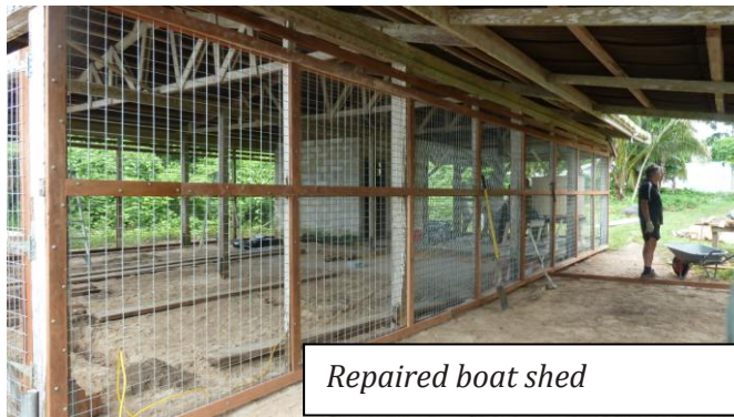
Repaired boat shed